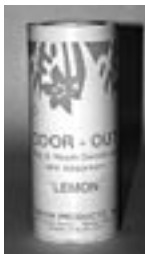
Packed: 12 cans/case