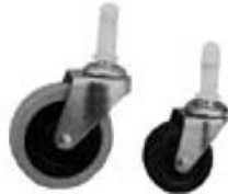
Casters for Mop Buckets