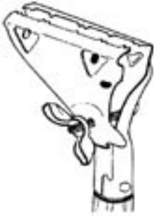
Jaw Type Wood Handle OUR BEST BUY