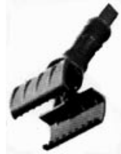
Gripper All Plastic won't chip, dent, or rust