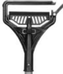
Quick Change All Plastic no wasted time