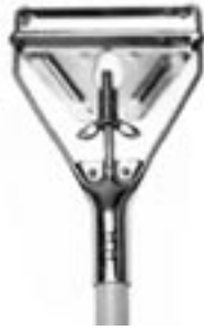
Center Bolt Wood Handle no screws to lose